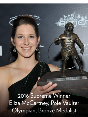
2016 Supreme Winner Eliza McCartney, Pole Vaulter Olympian, Bronze Medalist