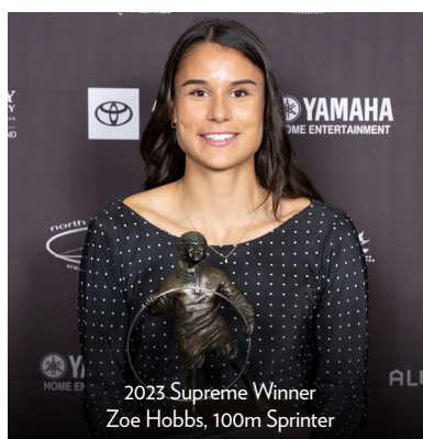
2023 Supreme Winner Zoe Hobbs, 100m Sprinter