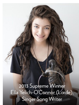
2013 Supreme Winner Ella Yelich-O'Connor (Lorde), Singer Song Writer