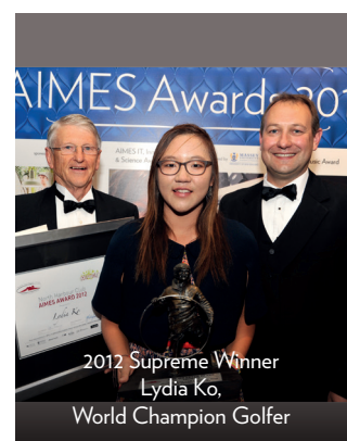
2012 Supreme Winner Lydia Ko, World Champion Golfer